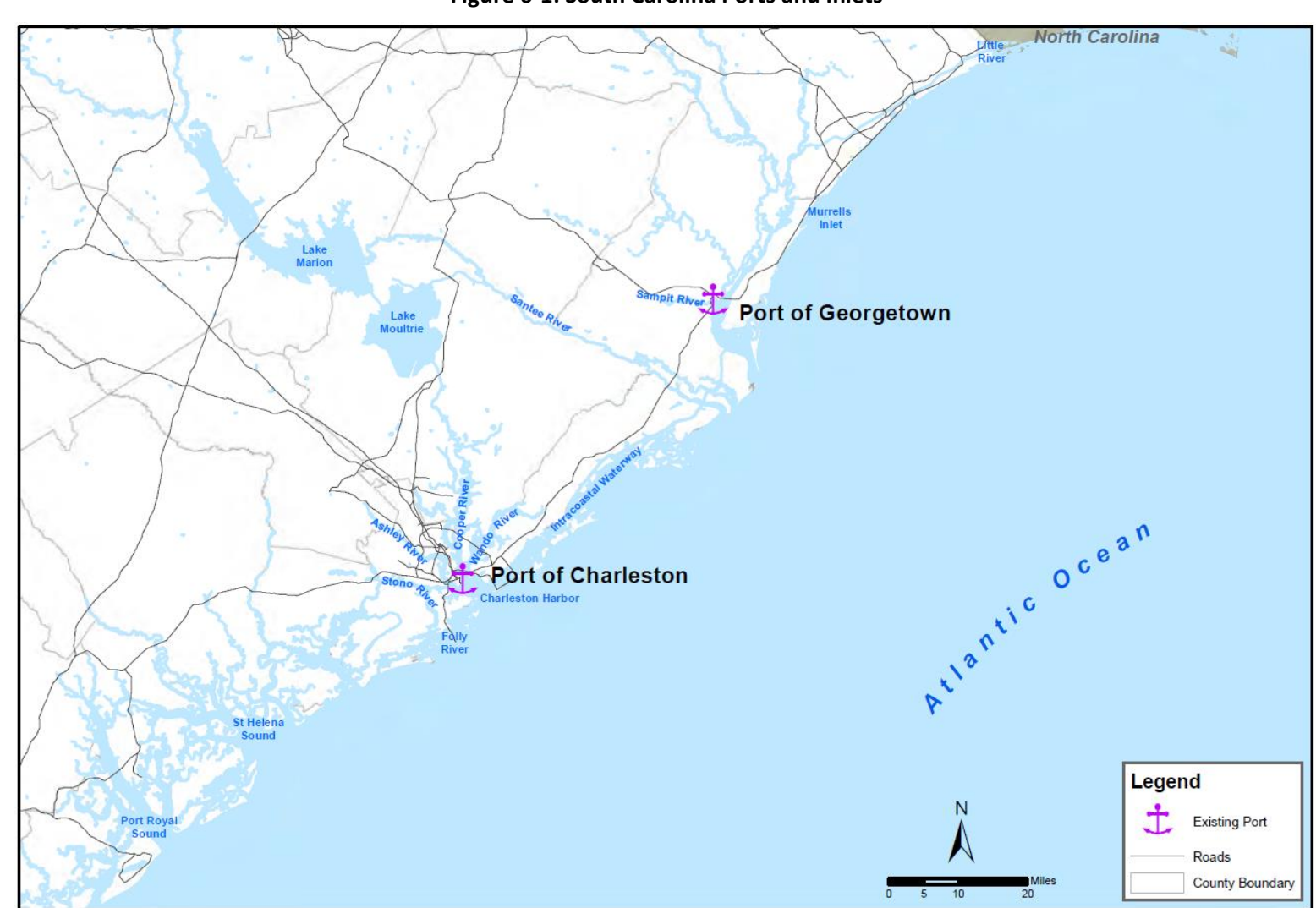
Figure 6-1: South Carolina Ports and Inlets